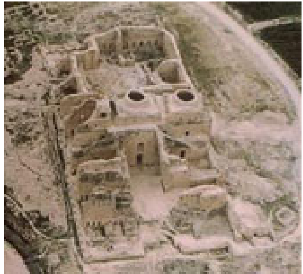
Fig. 1. Facing away from Shahre Goor.

Adobe and clay made astronomical benches which show months, are still perfectly in good condition. This have 65.5 meter diagonal and 12 marks of used sign in observational measurements and schematic benches. Probably these circular structures were in use for installation of sinusoidal device (Huff 1996).