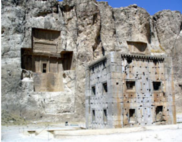
Fig. 2. Building of the tower.

observatory of Naqsh-e-Rustam is located in front of the crypts and is in short distance from Mountain (Fig. 2) (Bazoband 2013). From 1200 B.C. to 625 A.H. (1228 A.D.) this building was known as a sacred place.